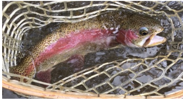
A 22" rainbow trout landed by Gary Woerderhoff on the Blue.